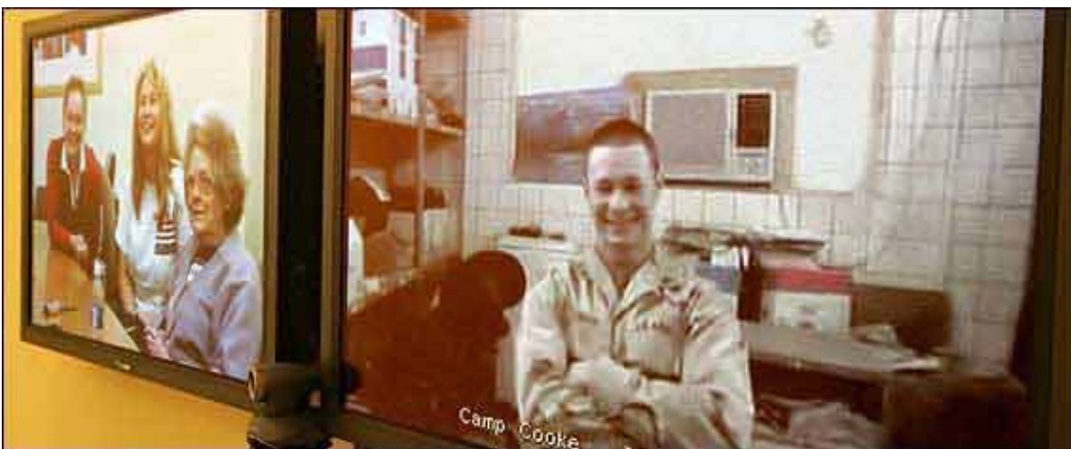
Family visits with son at Camp Taji in Iraq from Operation Hometown Link participant, Raytheon Company's headquarters